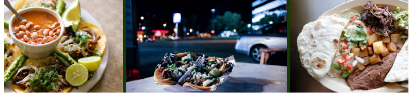
2. <u>La Macro</u> - 1207 West 20th Street