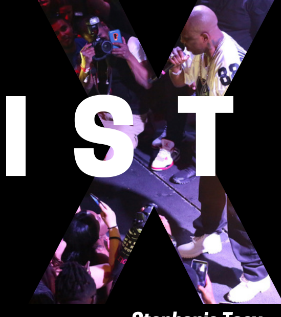
Stephanie Tacy Photographer || Curator