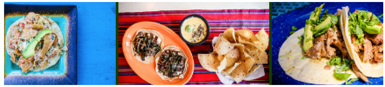
4. <u>Tacos Bomberos</u> - 2206 Edwards Street