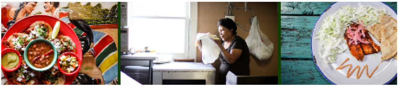
3. Taqueria Don Tin - 8505 Airline Dr.