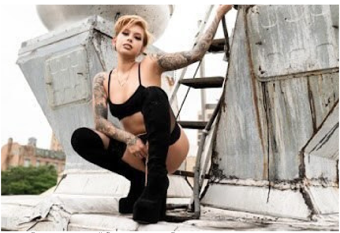
model <u>@vulgar.vanity</u>