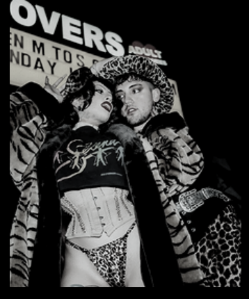
House of Lepore (Instagram: @<u>HouseOfLepore</u>)

House of Lepore was set to make history by being the very first performance group to showcase ball culture at the 2020 South by Southwest Conference & Festival in Austin, TX as official artists. Unfortunately, the event was cancelled as a result of the COVID-19 pandemic. The House stated they have chosen to see the cancelation of SXSW as a